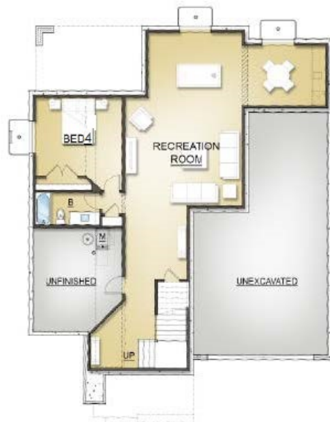
LOWER LEVEL | 1,411 SQ FT

For more information, contact us at 303-771-5995 or info@sattlercolorado.com