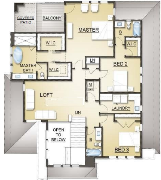
UPPER LEVEL | 1,624 SQ FT