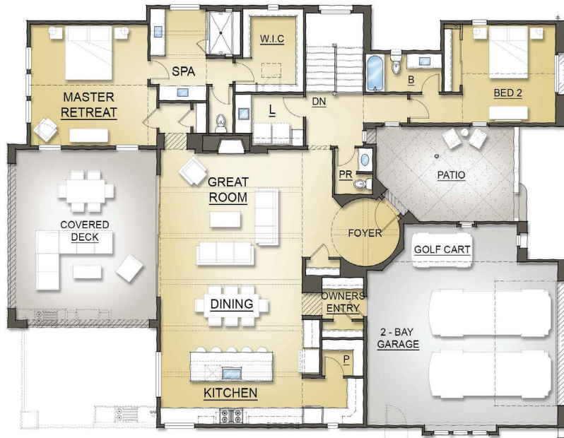
Main Level | 2,184 SQ FT