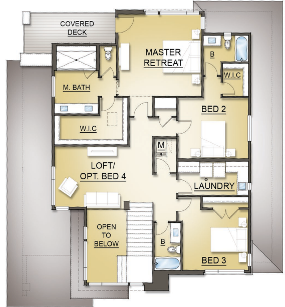
UPPER LEVEL | 1,507 SQ FT