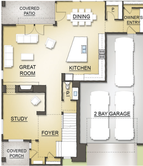
MAIN LEVEL | 1,525 SQ FT