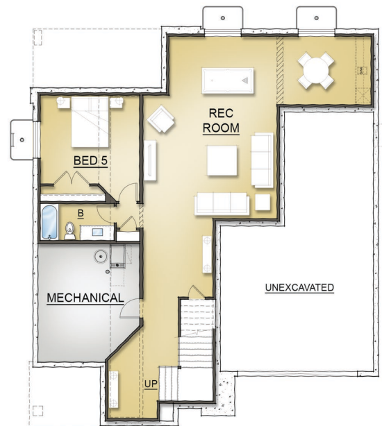
OPT. LOWER LEVEL | 1,180 SQ FT